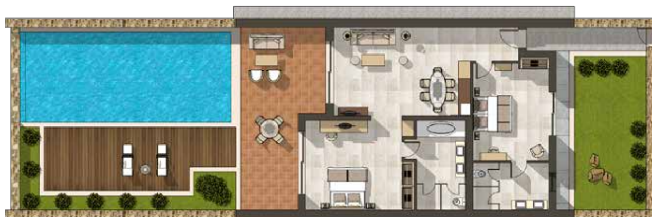
Two Bedroom Family Suite with Private Pool

The suite can accommodate up to six people - a maximum of four adults or three adults and three children up to the age of 12.