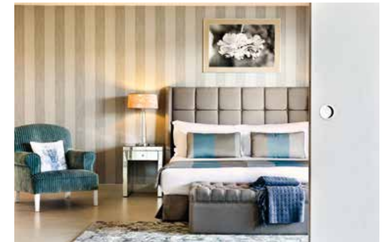
Deluxe Two Bedroom Family Suite