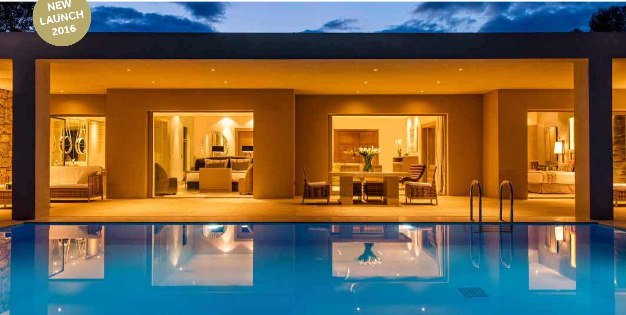
Three Bedroom Deluxe Suite with Private Pool